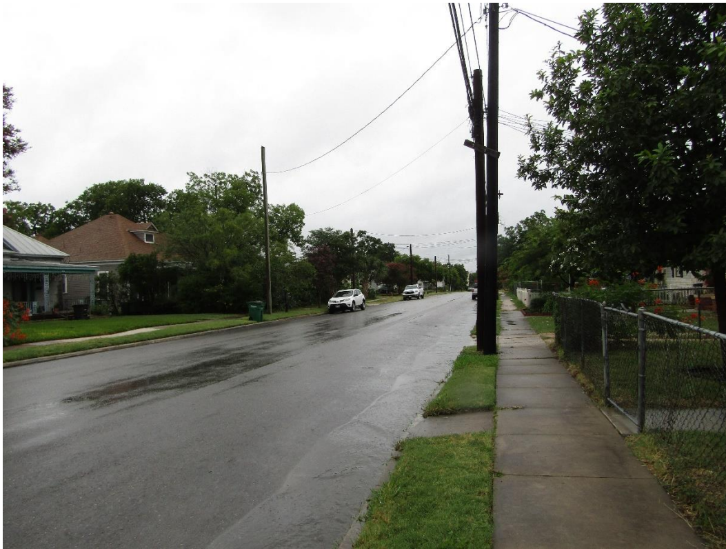
East Carson (east)