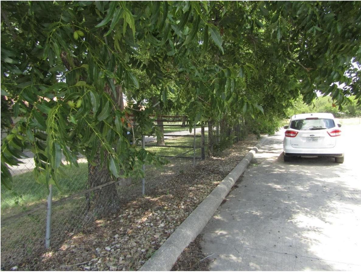
Austin Highway (north)