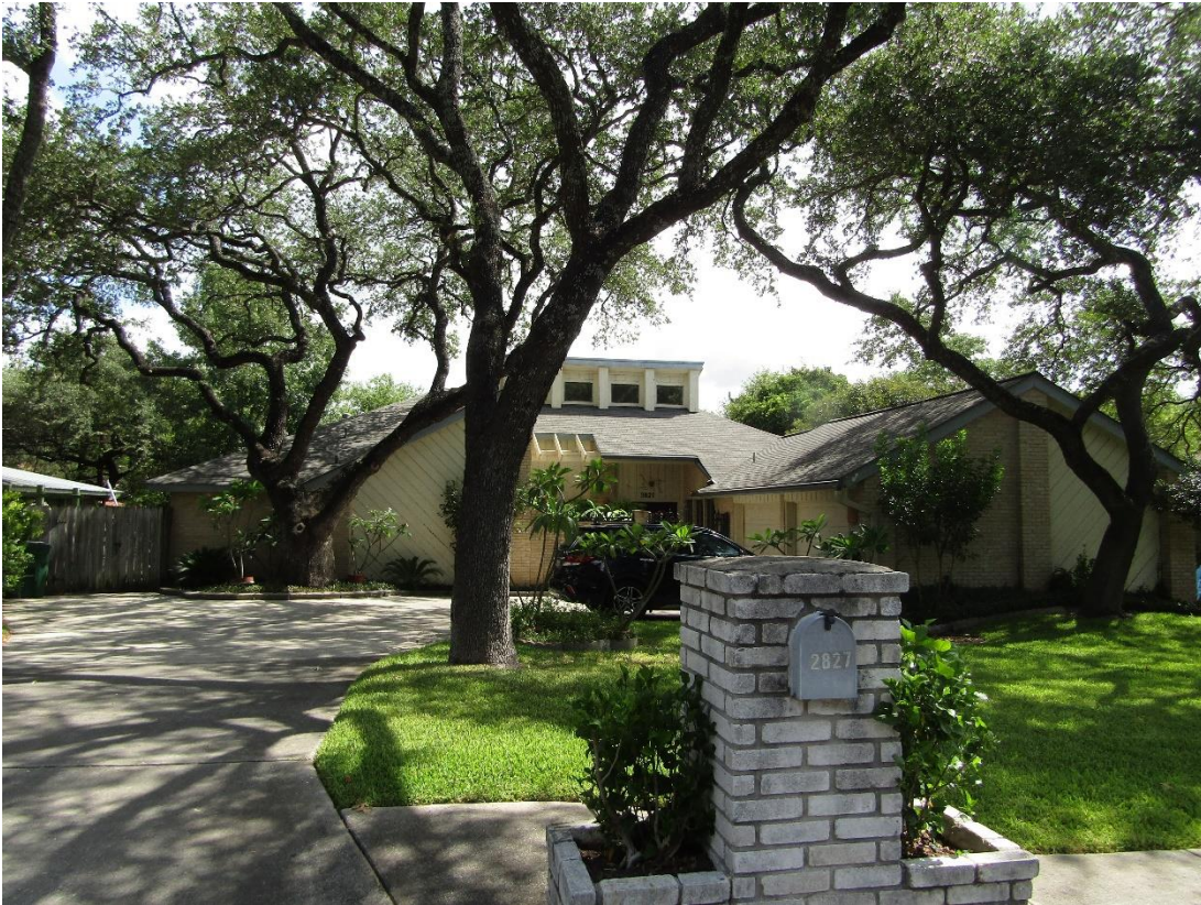
Subject Property; Side Yard