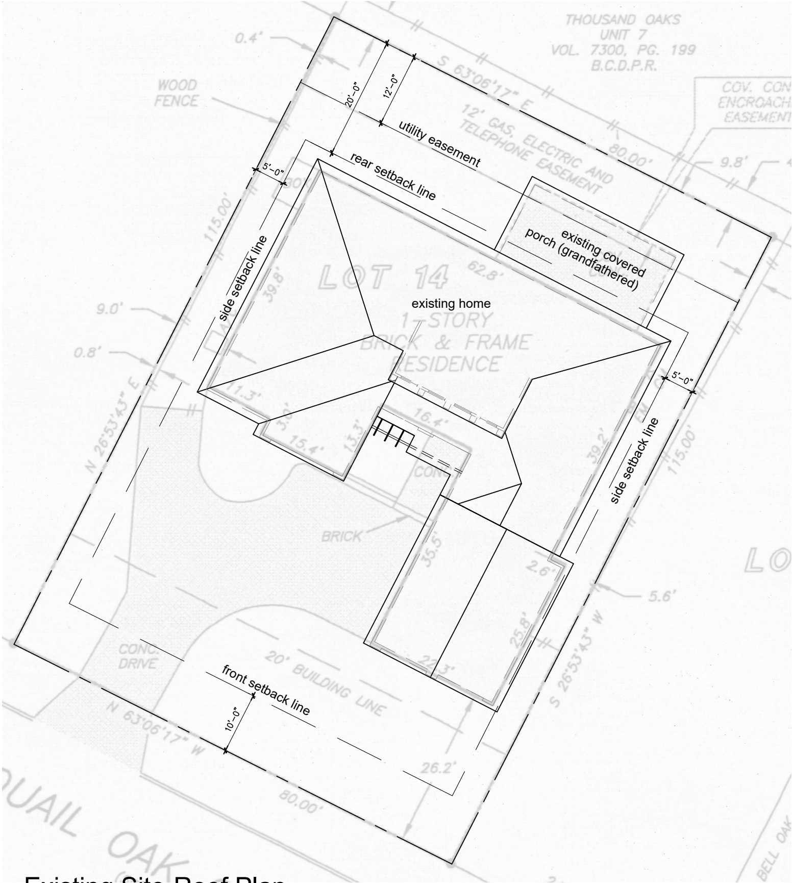
Existing Site-Roof Plan