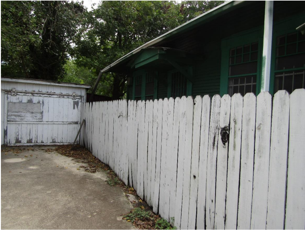
Proximity to Abutting Lot to the South