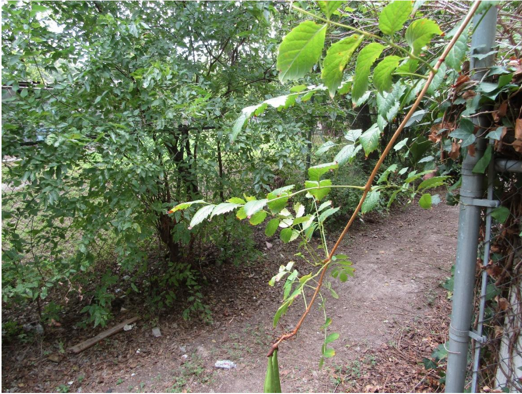
Alleyway behind the Subject Property