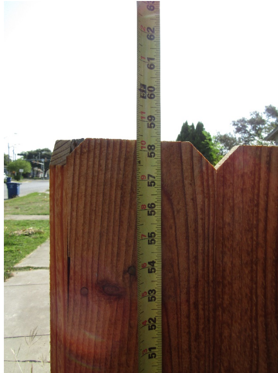
Front Yard Clear Vision Clearance