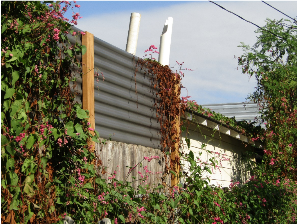
Side Fence 8'