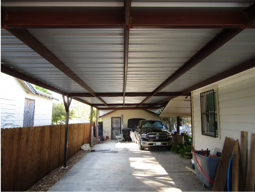
Proximity to Side Property Line