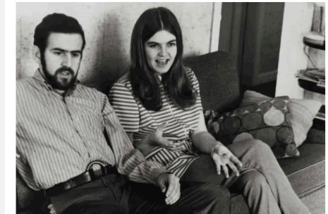
Air Force Lt. Sharon Frontiero, 23, filed suit against the Air Force claiming sexual discrimination in 1971 after not receiving the same military allowances as her male counterparts.