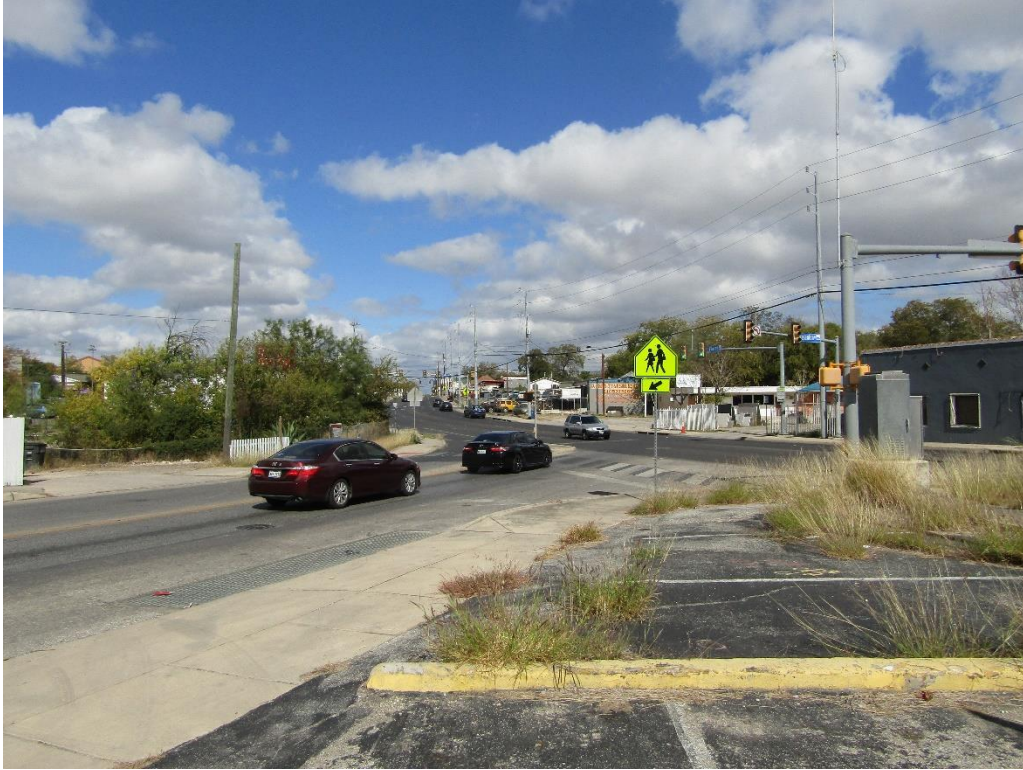
Surrounding Neighborhood (Eastside)