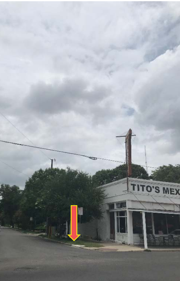
LOOKING W AT SUBJECT SITE