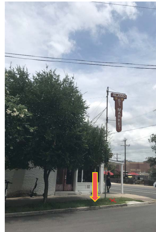
LOOKING NE AT SUBJECT SITE