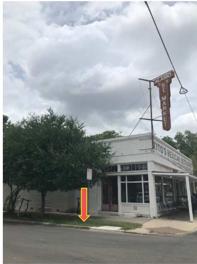
LOOKING N AT SUBJECT SITE