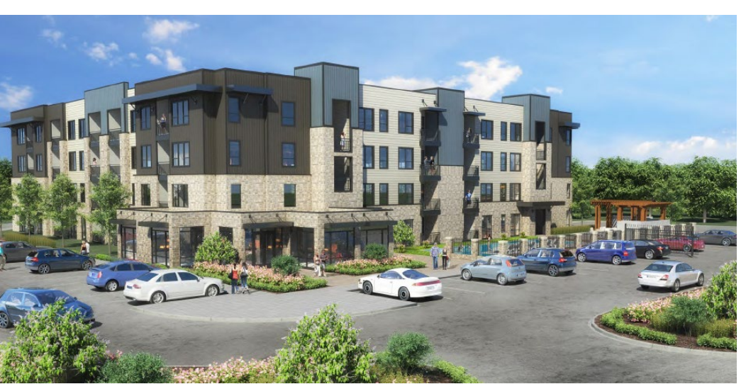
Vista at Everest, Atlantic Pacific Companies (2020 9% HTC recipient)