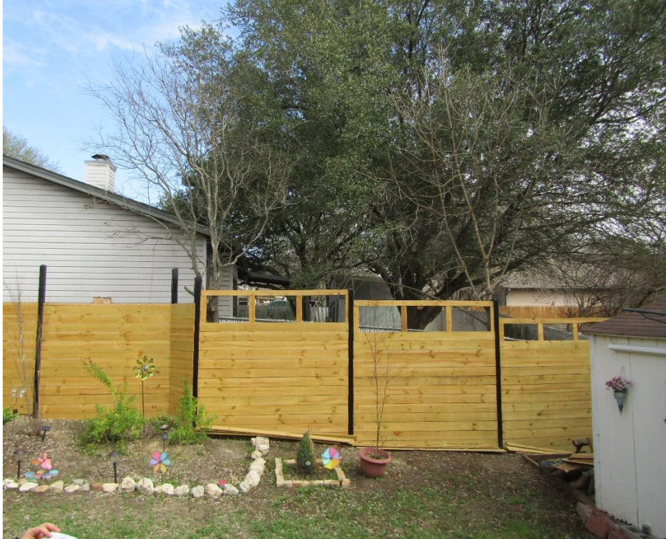
Subject Property (back yard fence)