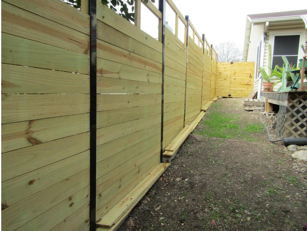
Subject Property (back yard and side yard fence)