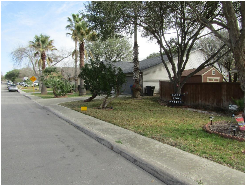
Subject Property (side yard fence height)