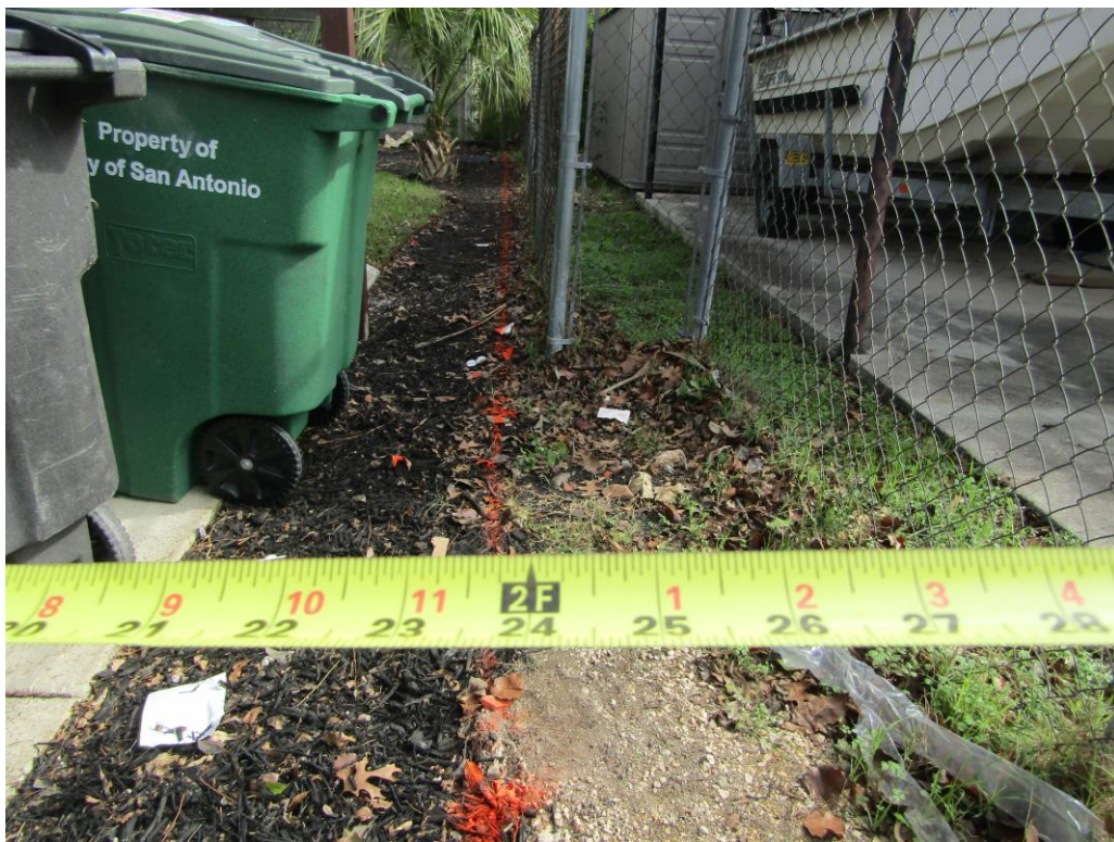
Proximity to Side Property Line