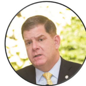
Marty Walsh Secretary of Labor