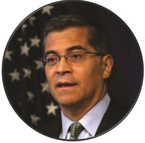
Xavier Becerra Secretary of Health & Human Services