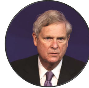
Tom Vilsack Secretary of Agriculture