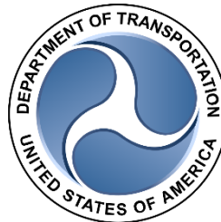
Pete Buttigieg Secretary of Transportation