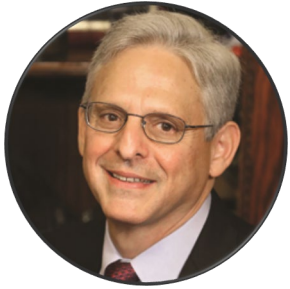
Merrick Garland Attorney General