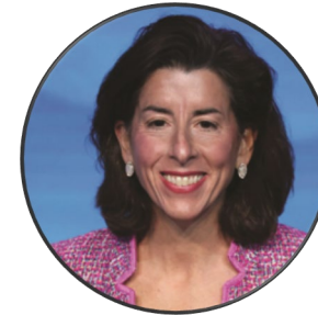
Gina Raimondo Secretary of Commerce