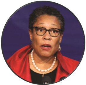
Marcia Fudge Secretary of Housing & Urban Development