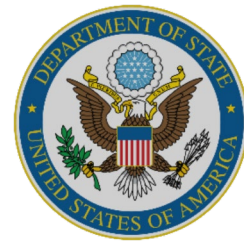
Tony Blinken Secretary of State