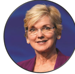
Jennifer Granholm Secretary of Energy