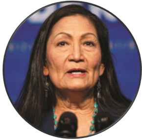
Debra Haaland Secretary of the Interior