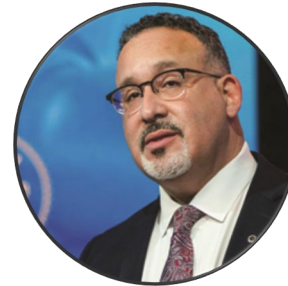
Miguel Cardona Secretary of Education