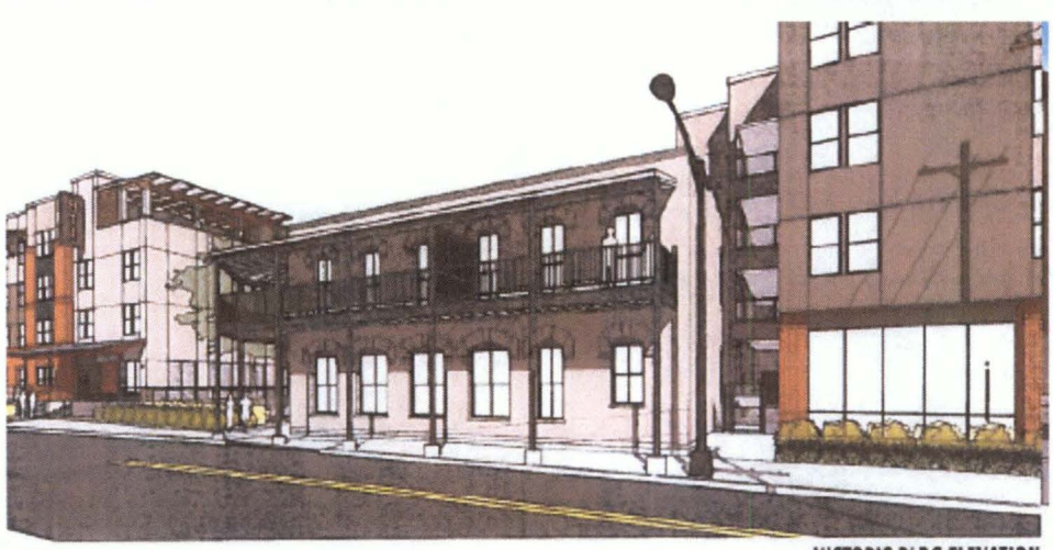
HISTORIC BLDG ELEVATION