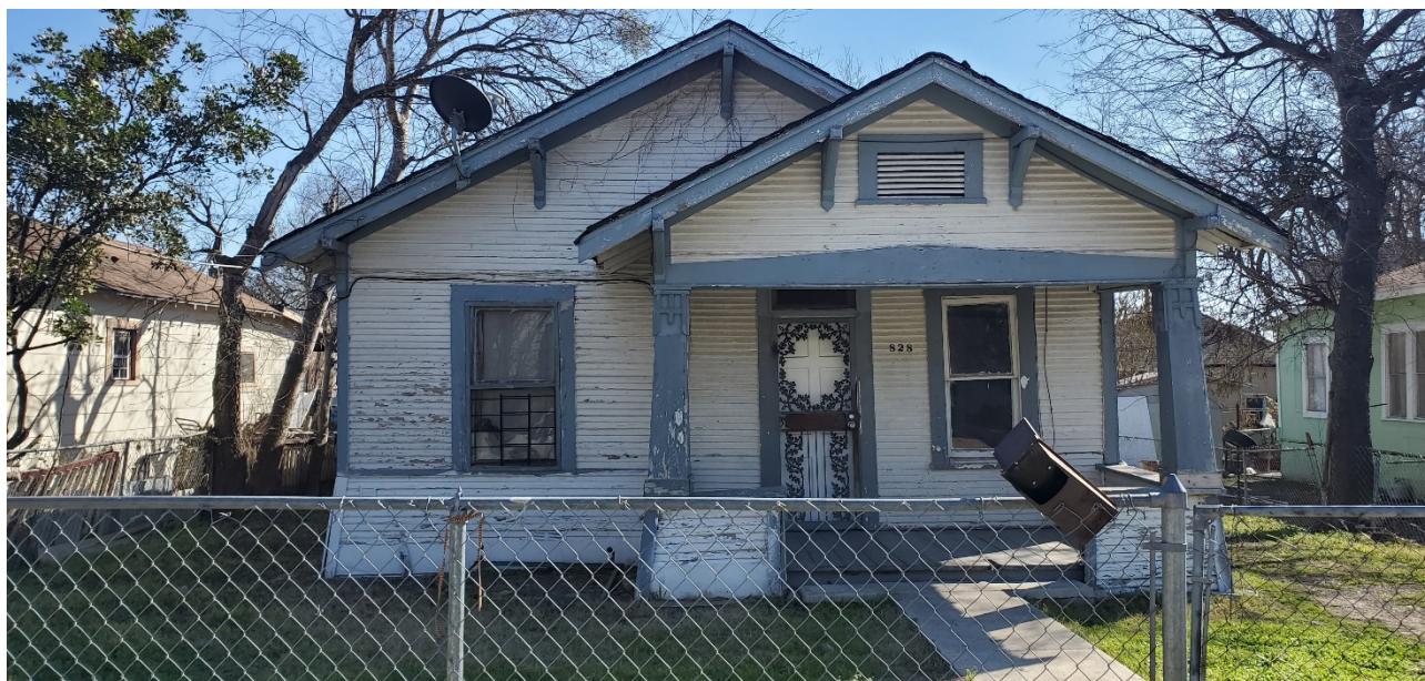
North (primary) elevation

1901 S. ALAMO ST, SAN ANTONIO, TEXAS 78204