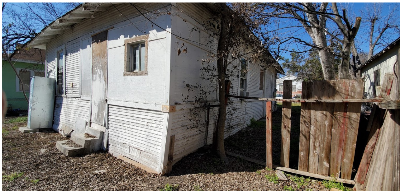
Southeast oblique, showing east elevation

1901 S. ALAMO ST, SAN ANTONIO, TEXAS 78204