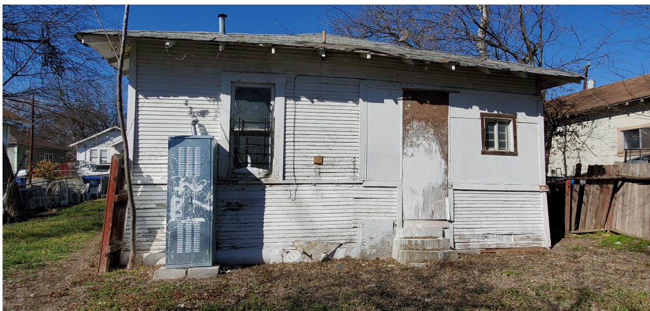
South (rear) elevation

1901 S. ALAMO ST, SAN ANTONIO, TEXAS 78204