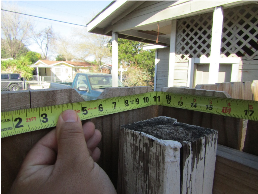
Carport still being constructed