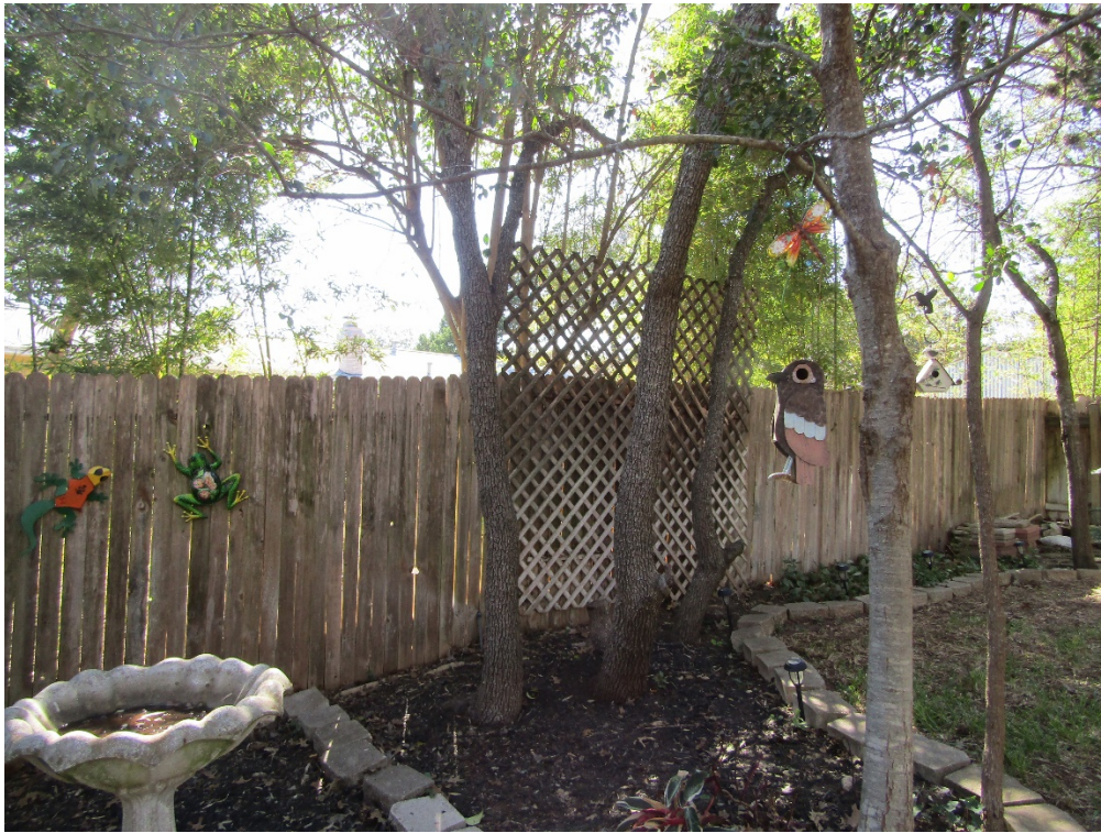
Subject Property (Backyard: proposed fence height)