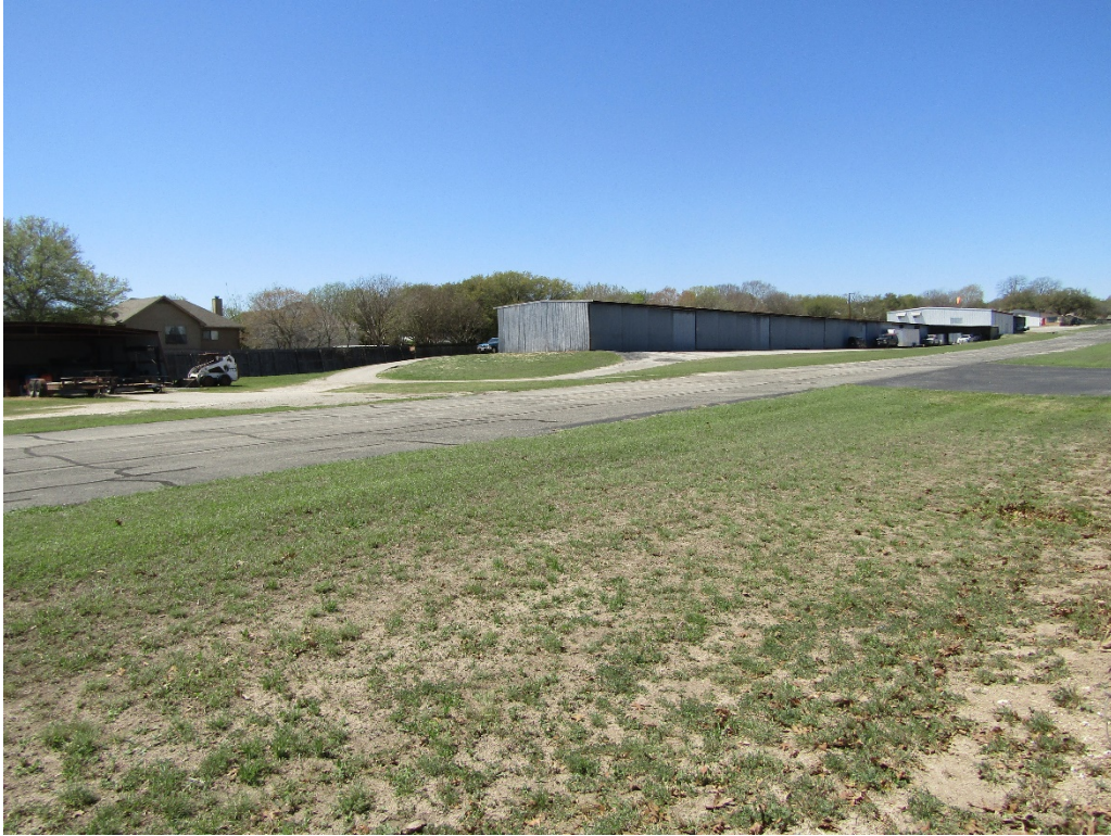
Privately-owned runway behind property