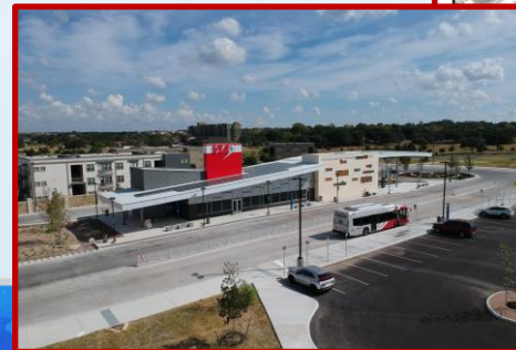
Alternate Projects for Presa Ramps (2012 Bond) Project