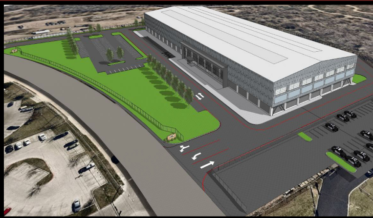
Artist's rendering of recycling facility at 6802 Culebra