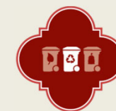
Per Ton Processing Fees and Net Expense to Cities