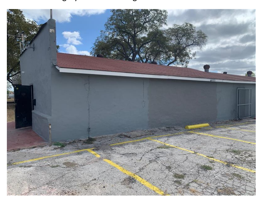
Proposed: Paint Dark Matter logo mural (Coffee brand to be served at Tandem)

Dark Matter Mural would be 5 feet by 5 feet .