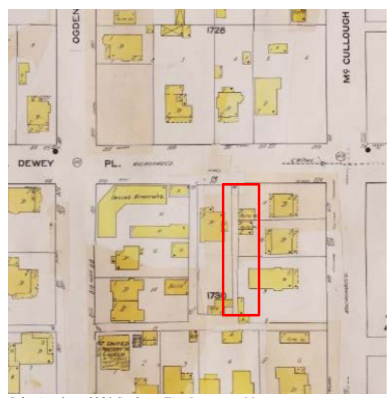
Selection from 1931 Sanborn Fire Insurance Map.