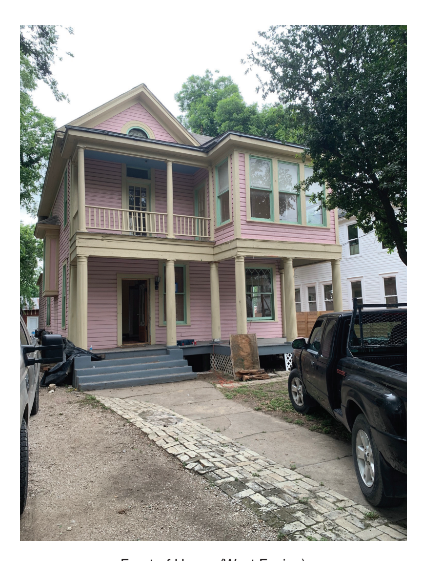
Front of House (West Facing)