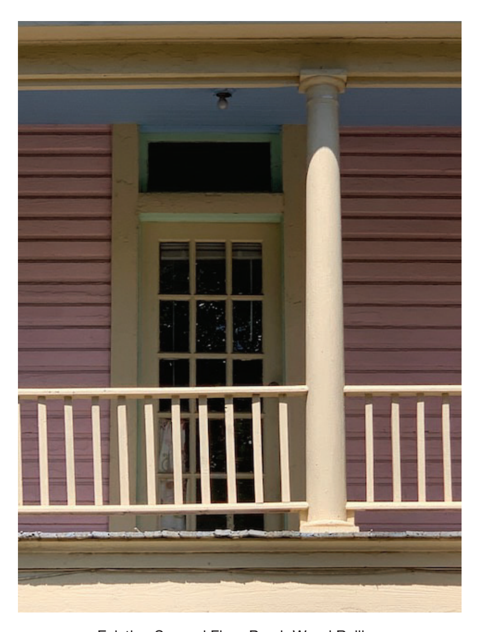
Existing Second Floor Porch Wood Railing