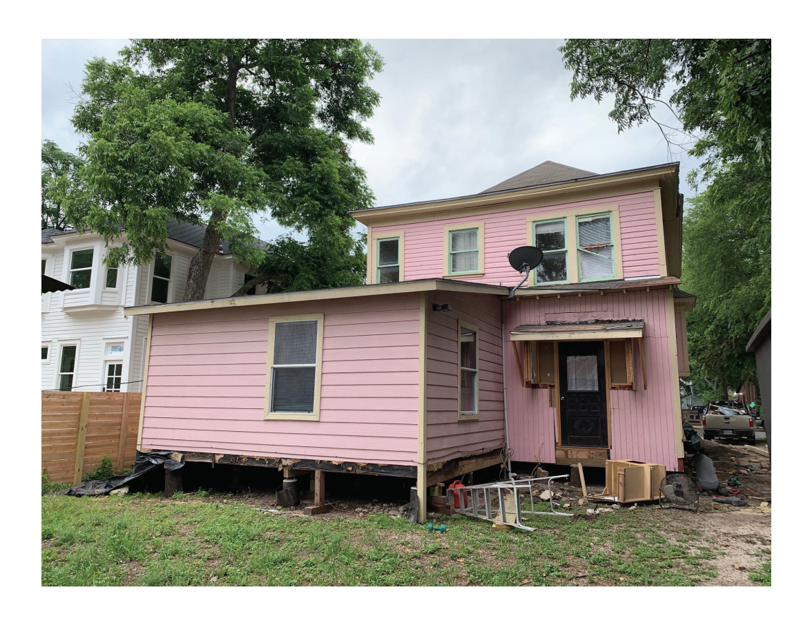
Rear of House (East Facing)