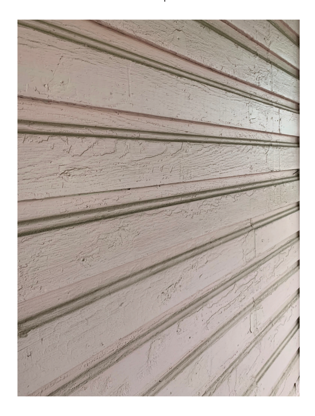
Existing Wood Siding