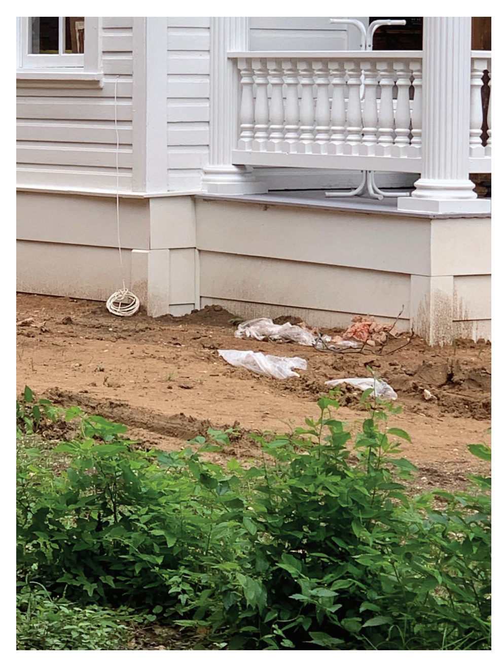
Proposed Skirting Example (at 418 Mission)