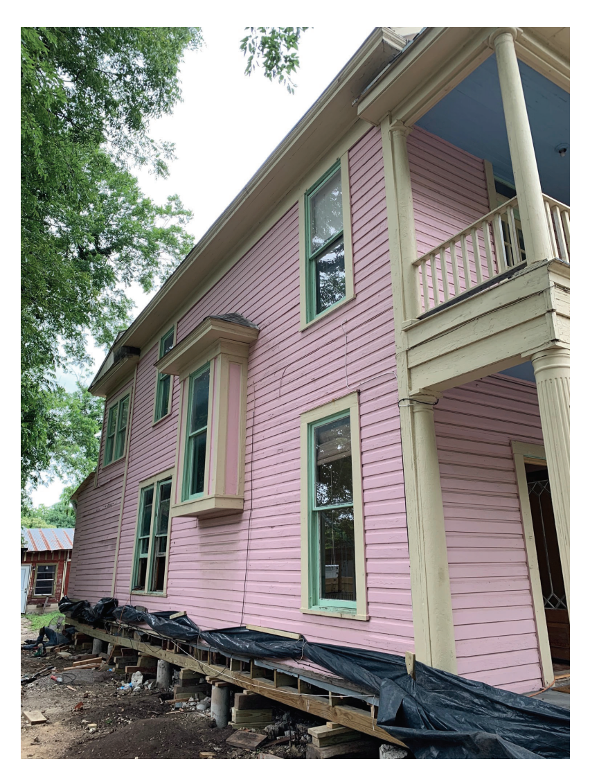
North Facing Elevation