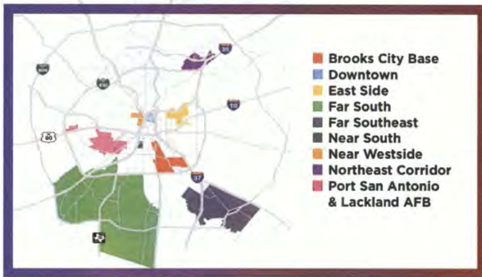
Figure 1: Map of San Antonio's Opportunity Zones Regions

Opportunity Zones have generated significant interest nationally given the tax incentive may attract tens of billions of dollars in private capital to communities. Cities are prioritizing efforts to market Opportunity Zones through the creation of an investment prospectus for the purpose of exhibiting distinct assets, marketing community profiles and strengths to enhance the attractiveness of Opportunity Zones for investors. Considering the activity on the national level, cities are producing marketing tools to remain competitive for investors. Currently, cities are creating an investment prospectus to market Opportunity Zones in the form of a static PDF document. Although the document provides information to encourage investment in their City, the utilization of a web-based platform will allow San Antonio a more intuitive, comprehensive, efficient and user-friendly method to market Opportunity Zones.