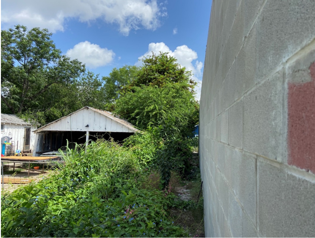
Back of Building to Property Line