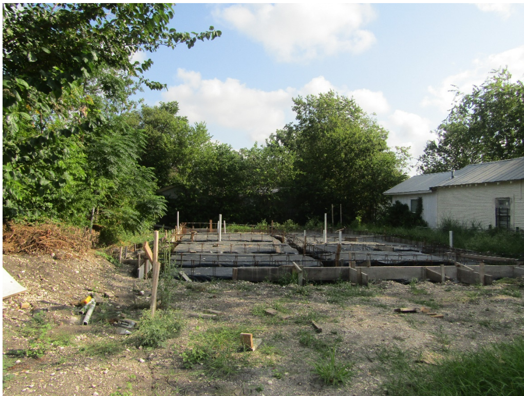
Left Side of Property

Subject Property: 2615 West Poplar Street