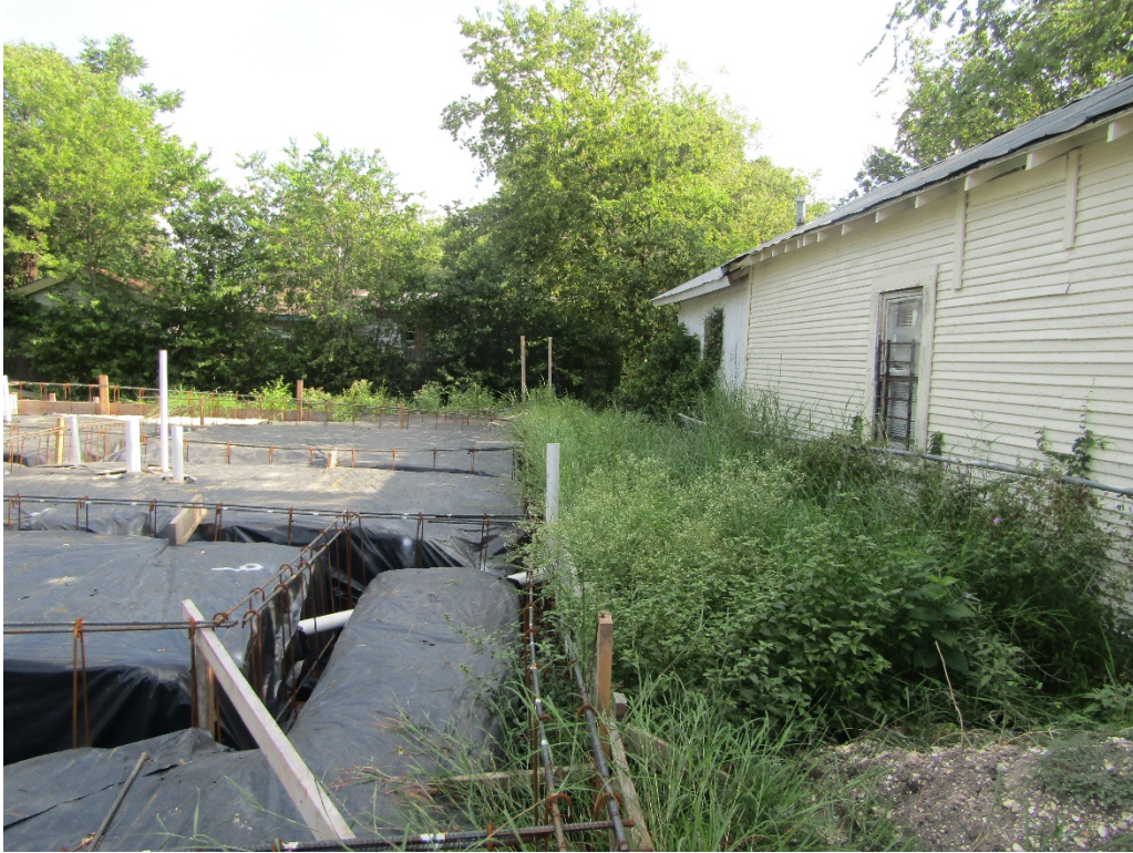
Rear setback 9' 8"