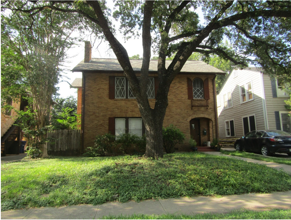
Existing Detached Accessory Dwelling

Subject Property: 206 East Lullwood Avenue