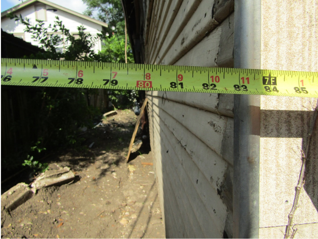
Rear of Subject Property